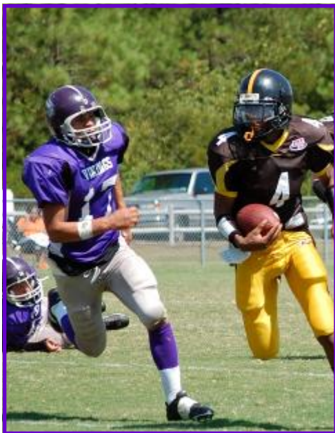
Get into the Backfield and Make their Day!