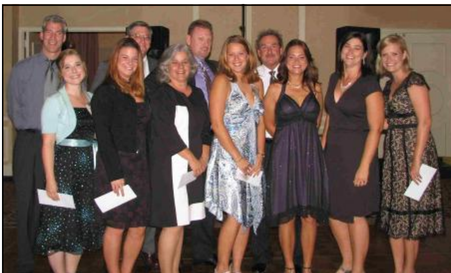
Middle School Staff