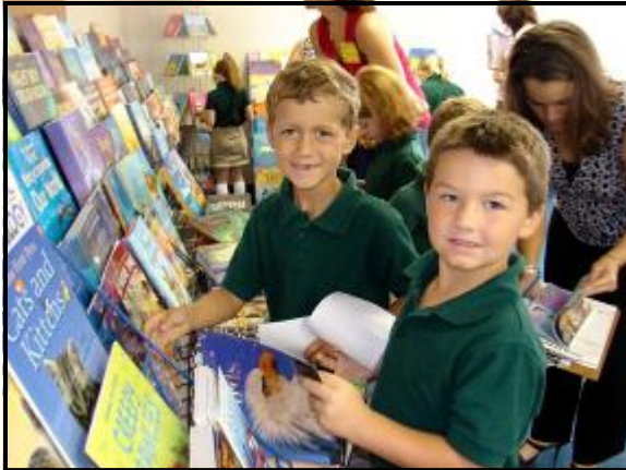
Columbus Charter School students at the book sale.

CC S students raised over $11,000 to purchase library books for their classrooms.