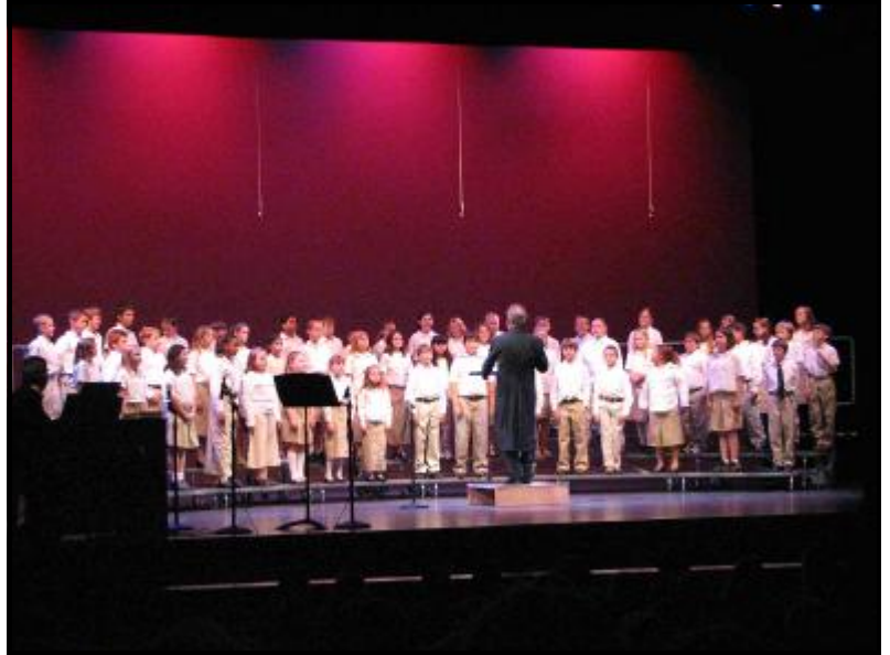
The Roger Bacon Chorus in Concert

Odell Williamson Auditorium Thursday Evening at 7 PM November 29, 2007 Free Admission