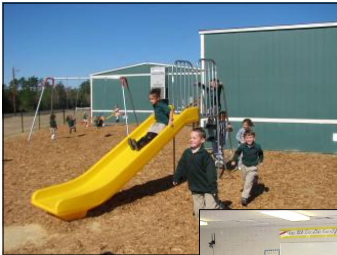
Recess: A Good Thing!