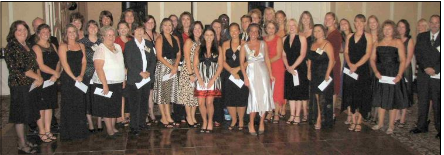
Charter Day School Elementary Teacher and Assistants