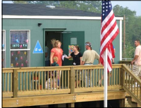
The first day of school!

Attired in their khaki and green uniforms, the children recite the Pledge of Allegiance and the school pledge, receive announcements of birthdays and other school news and then return to their classrooms to begin the day's academic work.