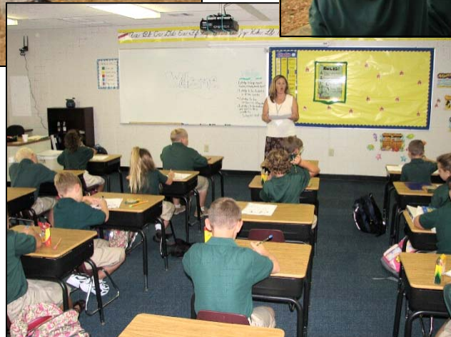
Already at work!