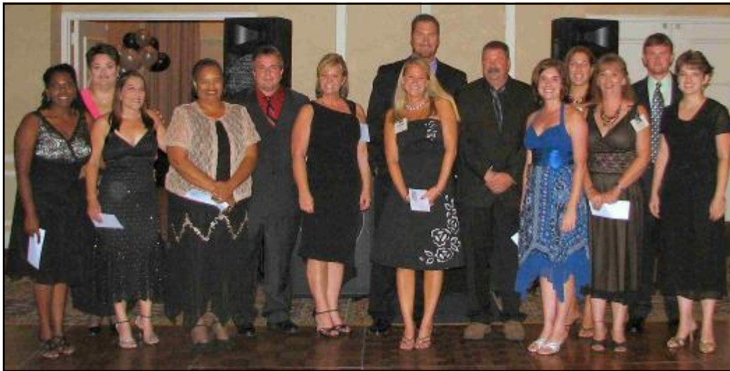
The Roger Bacon Academy Administrative and Support Staff