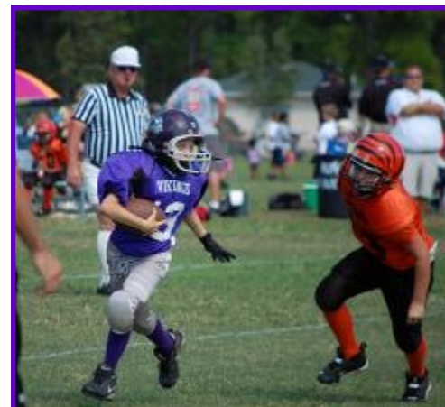
Speed on Offense Leads to Victories!