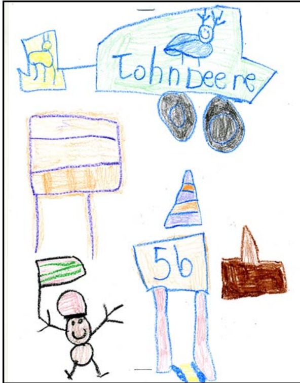
Wesley Ward, Age 5

CC S students score big in Area Arts Competitions.