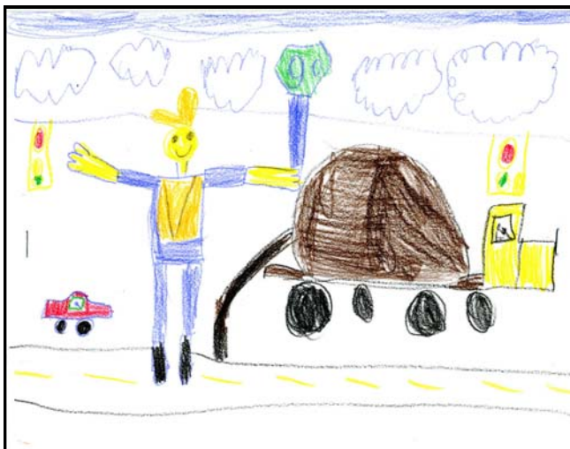
Reid Packer, Age 6

A few of the many fine entries are pictured here, and we wish everyone good luck with their art.